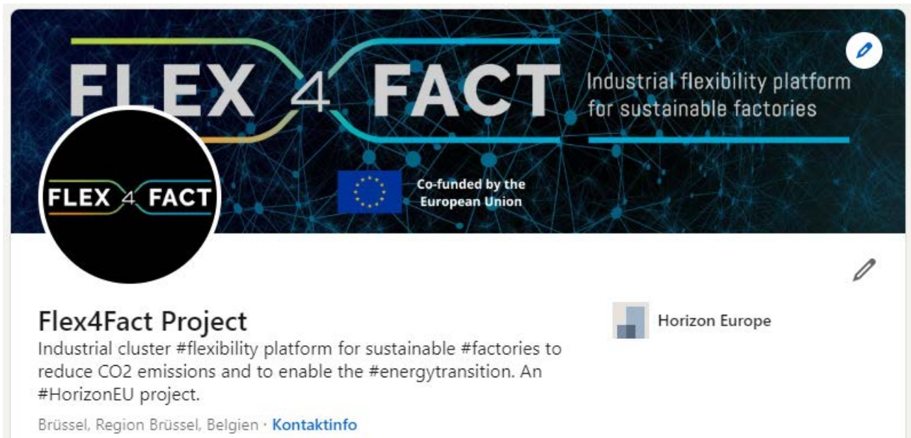
Figure 2 - Screenshot of the FLEX4FACT LinkedIn profile.