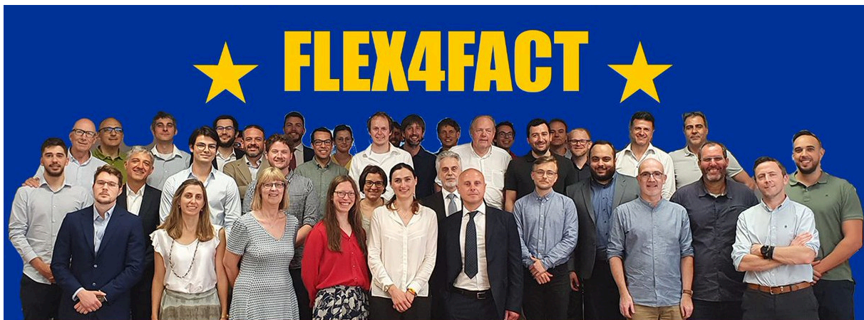
FLEX4FACT Kick-off meeting, 16-17 June 2022 (Barcelona, Universitat Politècnica de Catalunya)

The FLEX4FACT project officially started on June 1st, 2022, and will run for 42 months. A hybrid kick-off meeting held on June 16th and 17th brought together 23 organisations from 5 European countries representing the consortium. During the meeting, partners had the opportunity to introduce their competences and skills and to discuss and validate an action plan for the upcoming weeks and months of the project. With the successful launch, the partners can now start implementing the project.